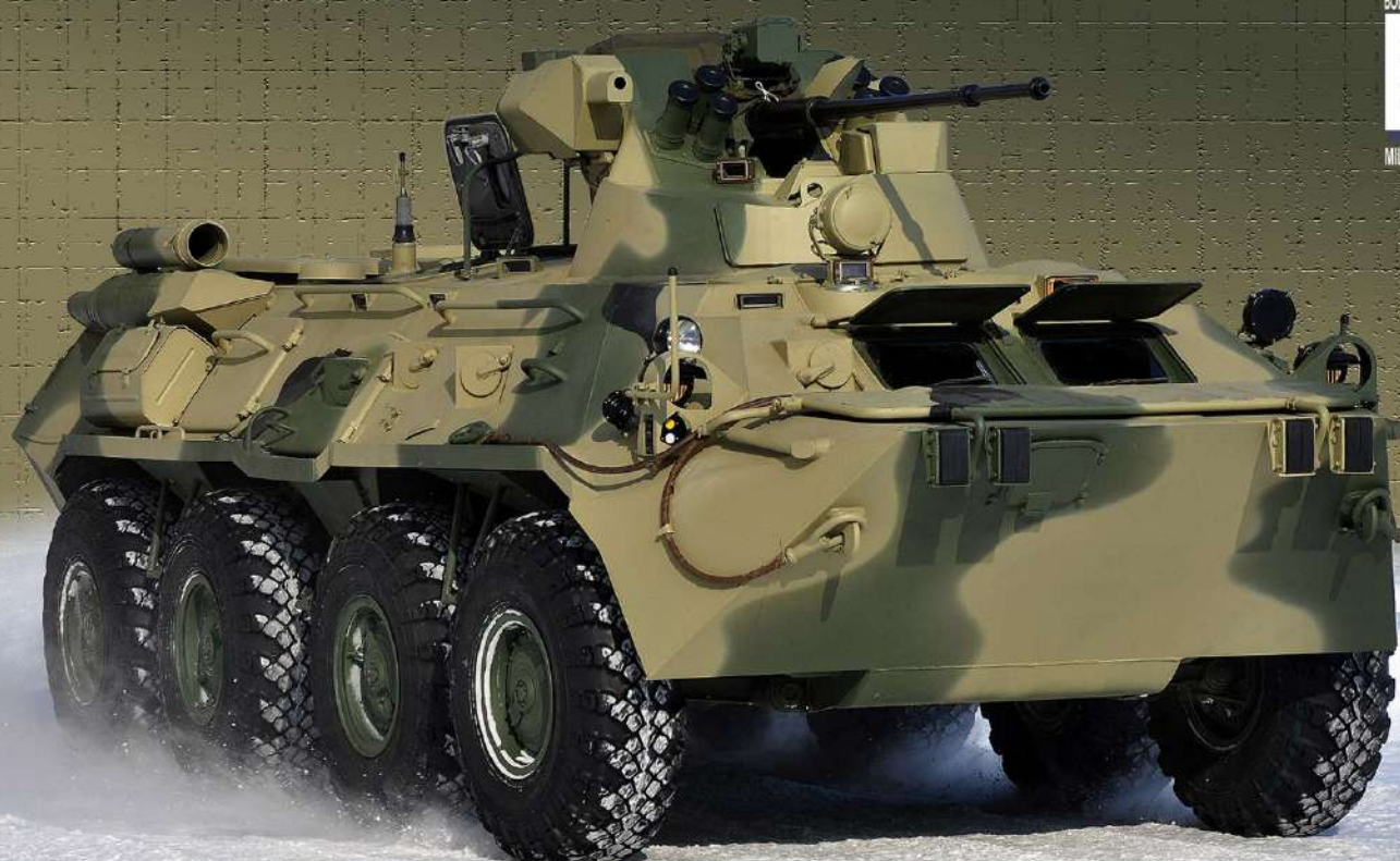
BTR-82A ARMORED PERSONNEL CARRIER

ВОЕННО-ПРОМЫШЛЕННАЯ КОМПАНИЯ ВПК MILITARY-INDUSTRIAL COMPANY