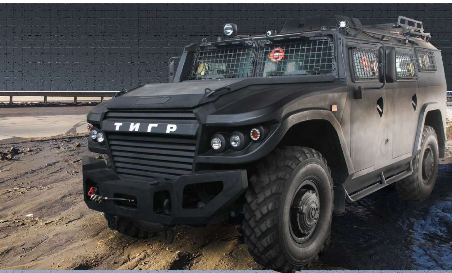
SBM VPK-233136 TIGR SPECIAL ARMoured VEHICLE EQUIPPED WITH THE 'RAID' PACKAGE