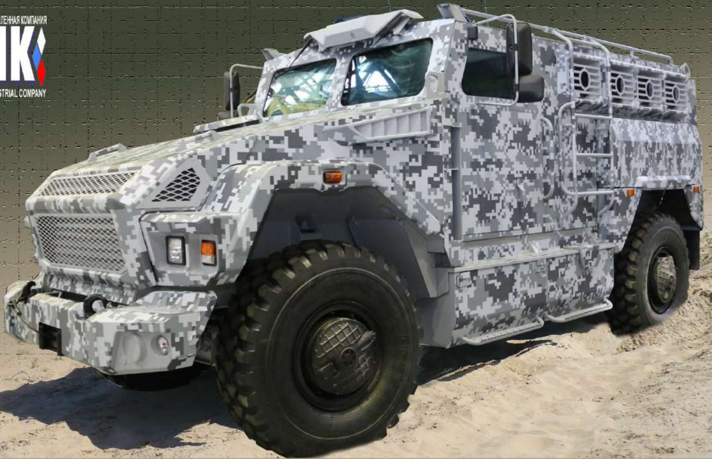
VPK-3924 'MEDVED' SPECIAL POLICE VEHICLE

ВОЕННО-ПРОМЫШЛЕННАЯ КОМПАНИЯ ВПК MILITARY-INDUSTRIAL COMPANY